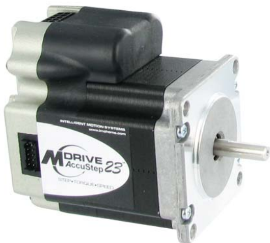
Pictured: MDrive AccuStep 23

Two MDrive AccuStep product versions are available: