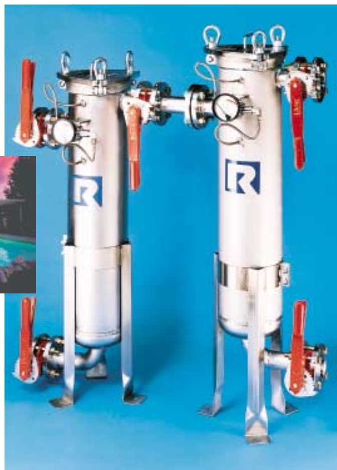
NSF-Rated Giardia Filtration System

The federal government has provided the Surface Water Treatment Rule (SWTR), which specifically requires the control of Giardia in public water supply systems. The SWTR establishes performance criteria for water treatment to ensure a 99.9 percent reduction of Giardia in water supplies.