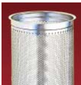
Model FF Replaces Filtration Systems baskets 112, 122