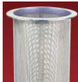
Model RP Replaces Ronningen-Petter baskets 224, 324, 424, 152