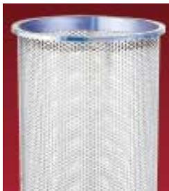
Model CF Replaces Commercial Filter baskets SB11, SB12