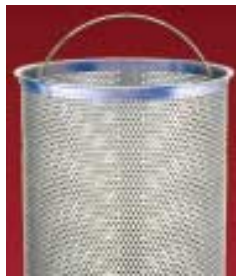
Model CU Replaces Cuno baskets 7PC1, 7PC2