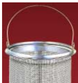
Model STR Replaces Strainrite baskets UF1-90, UF1-180