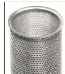
With wire mesh lining

PERFORATED WITH WIRE MESH LINING STRAINER AND FILTER BAG BASKETS: Stainless steel wire is used in mesh sizes 30, 60, 100, 150, or 200. When used as a bag filter basket, the following advantages are realized: