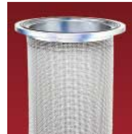
Model AFF/GAF Replaces American Felt & Filter/GAF baskets 112, 122, AMS R, AMC R, NCX, RBX 1L, RBX 2L