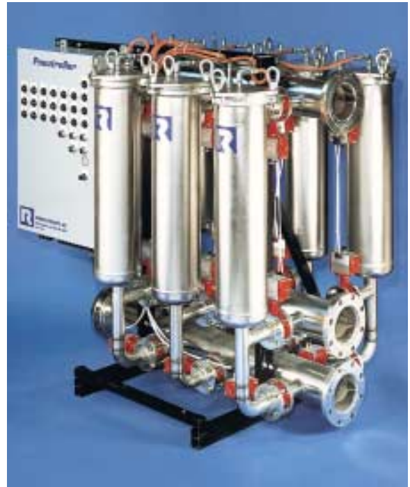
7 Single Station Pneutroller