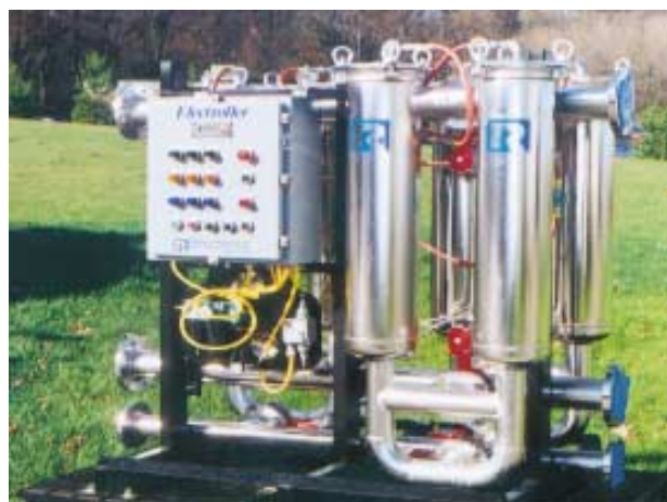
3 Dual Station Electroller

Flow rates from less than a hundred to several thousand GPM can be easily accommodated. Also, to meet footprint or space requirements, we can configure the systems on one side of the headers for long narrow aisles or up against walls or place the housings on both sides of the headers for shorter, but broader areas. Combustible/Explosive areas can take advantage of our state-of-the-art Air Logic control systems which are totally pneumatic and inherently safe. Micron ratings from 5 micron and larger are available in a variety of filter media including standard bags and wedgewire. Continuous flow is maintained by taking only one station at a time off-line for cleaning - the rest of the housings continue filtering.