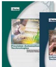
Electromechanical Precision Bulletin AU01-5000/US

Covering Electromechanical and Pneumatic markets, each of our catalogs is paired with an interactive CD. Call for your comprehensive guides today. 800-272-7537