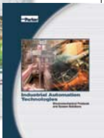
Electromechanical Industrial Bulletin AU01-7500/U